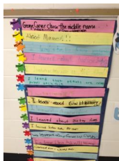
Third grade students are working with a mock Twitter feed to post daily class activities.