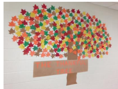
Students included what they are most thankful for on the leaves of the "thankful tree" at Bessie Weller.